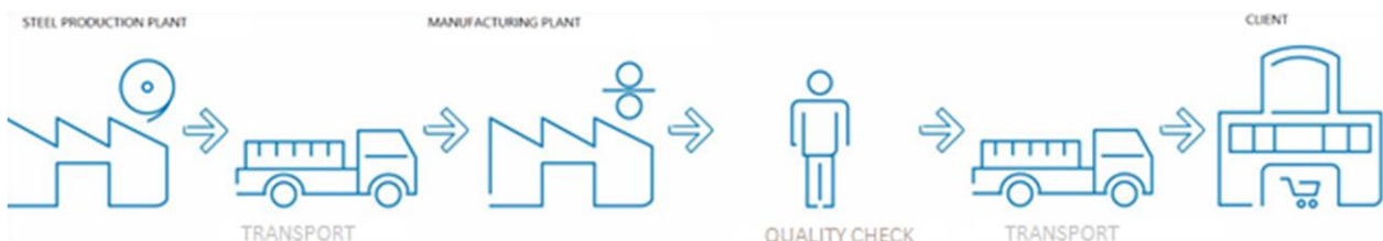
Figure 1. Production process for galvanized steel and stainless steel.

During the manufacturing process steel coils are de-rolled and transferred through roll forming machines with a series of dies that progressively shape the steel into desired shaped section or formed into a variety of shapes. For products made of galvanized steel or stainless steel process is provided in Figure 1.